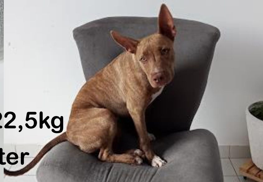
Frida – 6 meses e 22,5kg Raça: Pitbull Monster